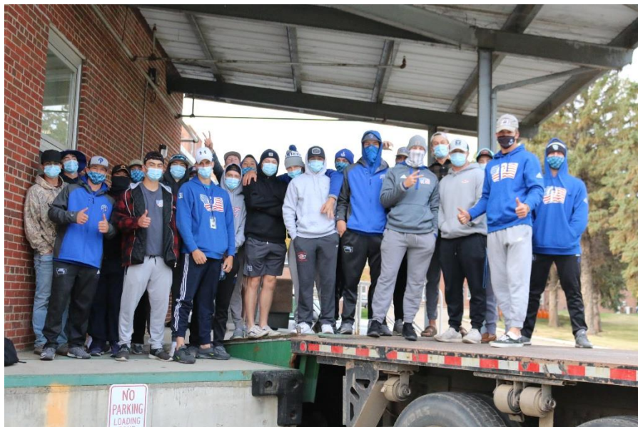
IMAGES: MCC Baseball Team stopped to pose while loading appliances on a flatbed truck